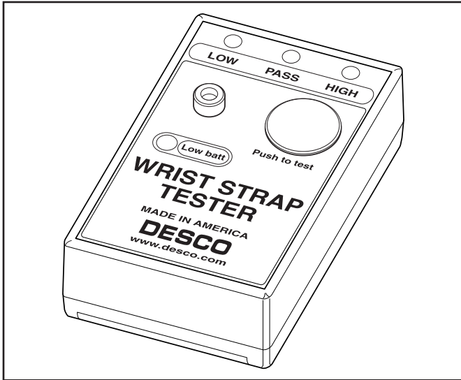
Figure 1. Model 19240 Wrist Strap Tester

Pass Range 800K Ohms to 10 Megohms, 9 Volt Battery Operation