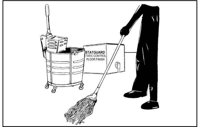
Figure 4. Applying floor finish