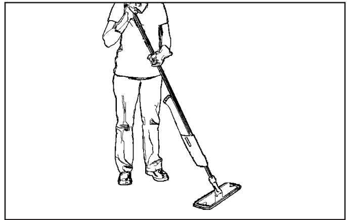
Figure 5. Applying floor finish with Flat Mop (optional).