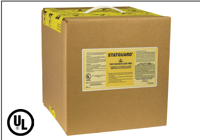
Figure 1. Statguard® Static Dissipative Floor Finish