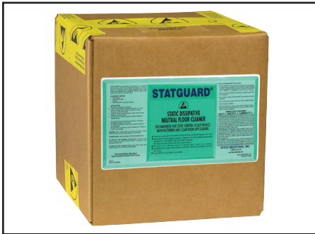
Figure 1. Statguard® Dissipative Neutral Floor Cleaner