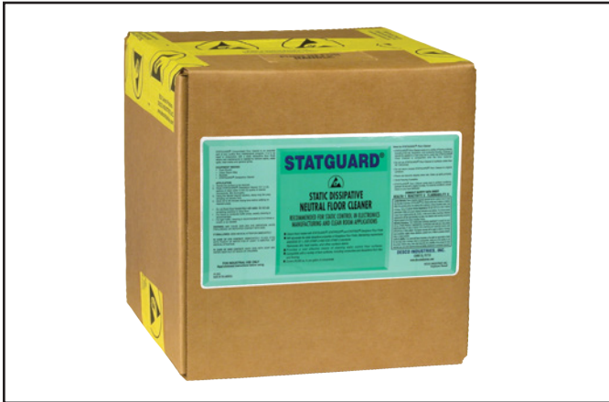
Figure 1. Statguard® Dissipative Neutral Floor Cleaner