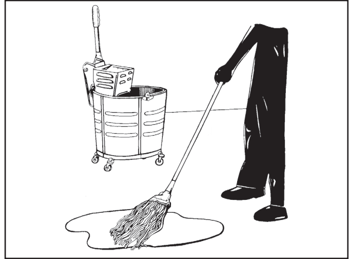
Figure 2. Applying the Statguard® Low Residue Floor Stripper with a cotton mop