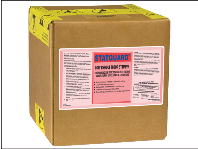
Figure 1. Statguard® Low Residue Floor Stripper