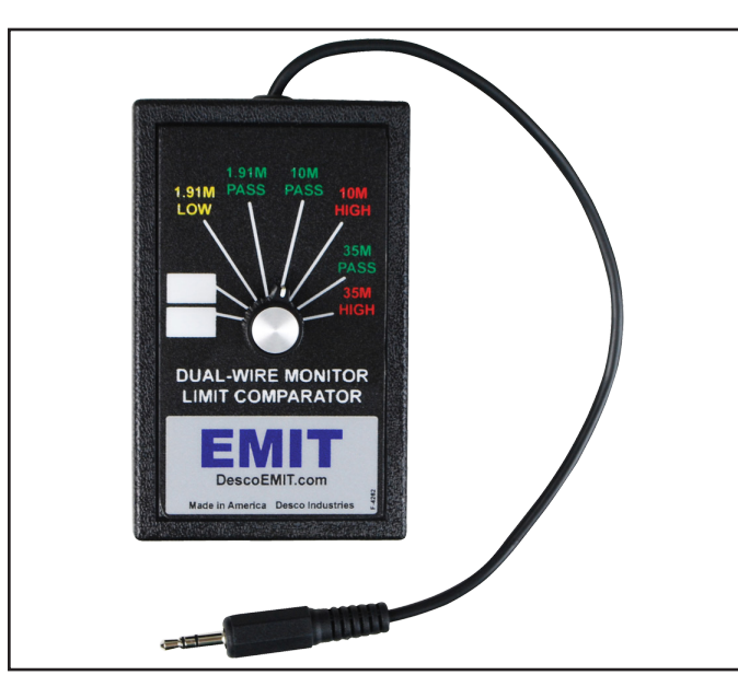
Figure 1. EMIT 50524 Limit Comparator