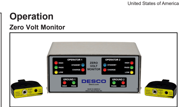
Figure 2. Desco 19668 Zero Volt Monitor