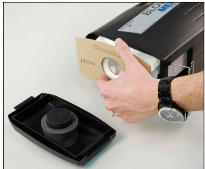
Figure 5: Removing and Changing the Filter