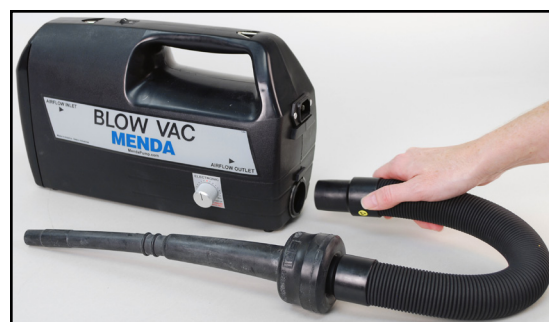
Figure 2: Connecting the hose to the airflow outlet.