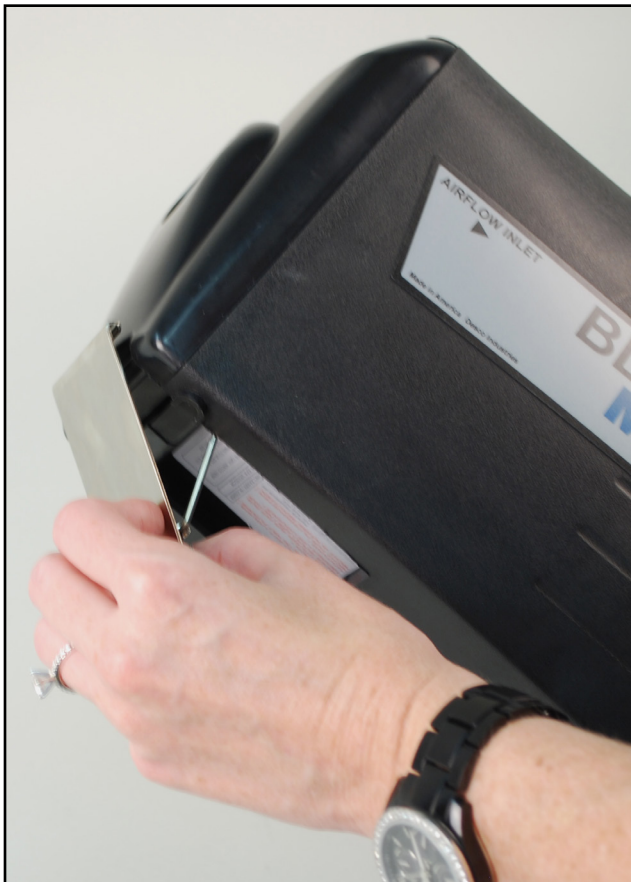
Figure 4: Releasing the Filter