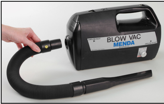
Figure 3: Connecting the hose to the airflow inlet.