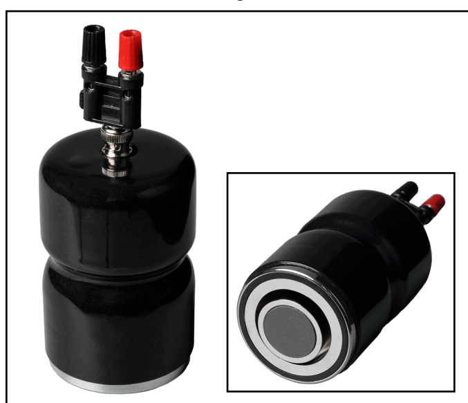
Figure 7. Desco 50005 Concentric Ring Probe

The Desco 50005 Concentric Ring Probe is an instrument to be used in conjunction with a resistance meter, such as the Desco 19787 Digital Surface Resistance Meter, to measure surface resistance per ANSI/ESD STM11.11 the test method listed in Packaging standard ANSI/ESD S541 for surface resistance of planar materials.