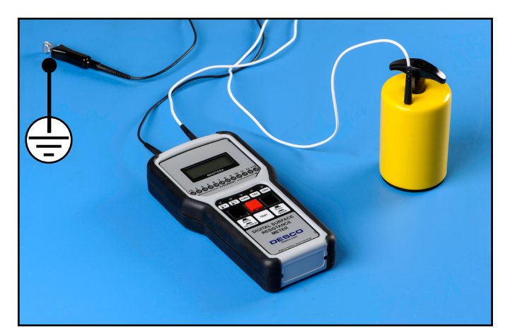
Figure 5. Rtg test setup

If the measurement is outside acceptable limits, clean the surface with an ESD cleaner containing no insulative silicone such as <u>Reztore™ Antistatic Surface & Mat Cleaner</u>, and re-test to determine if the cause of failure is an insulative dirt layer or the ESD worksurface material.