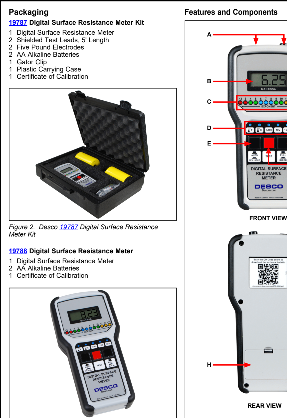
Figure 3. Desco <u>19788</u> Digital Surface Resistance Meter Figure 4. Digital Surface Resistance Meter features and components

DESCO WEST - 3651 Walnut Avenue, Chino, CA 91710 • (909) 627-8178 DESCO EAST - One Colgate Way, Canton, MA 02021-1407 • (781) 821-8370 • Website: Desco.com