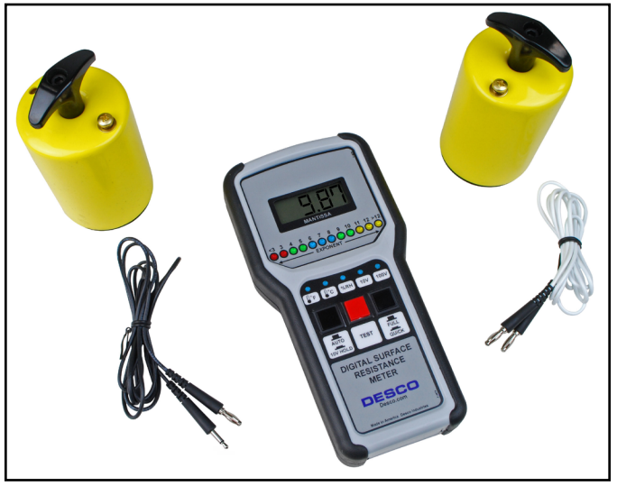
Figure 1. Desco Digital Surface Resistance Meter Kit