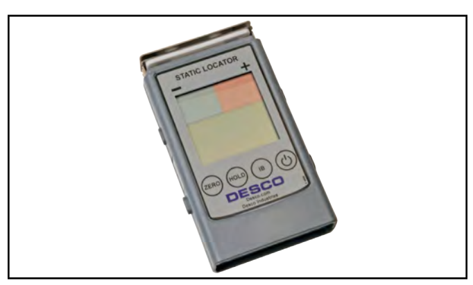
Figure 1. Digital Static Locator Item #19430