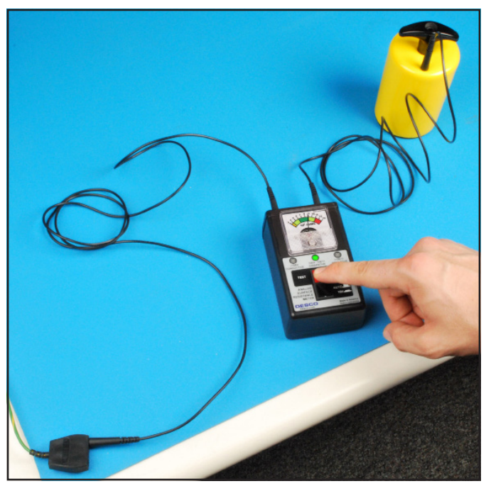
Figure 3. Using the test leads and one 5 pound electrode to measure RTG

CAUTION: If there is a current limiting resistor in the worksurface and the worksurface resistance is lower. the measurement will primarily be the resistance of the resistor. It is recommended to measure RTT particularly if the material color is black.