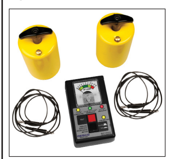
Figure 1. Desco 19784 Analog Surface Resistance Test Kit